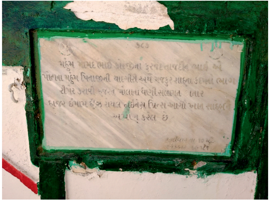
FIGURE 4" An inscription at Shāh Jā Qadam (1951)