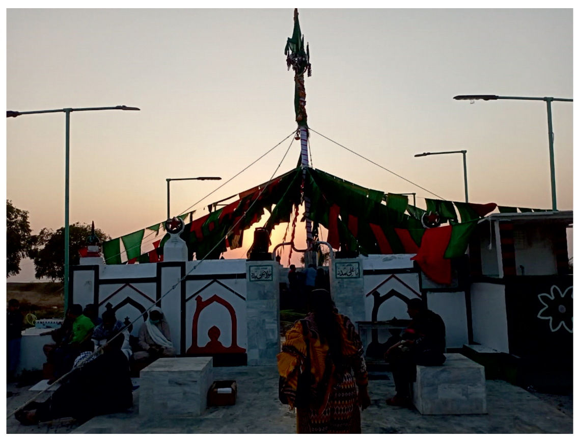
FIGURE 3: Current View of Shāh Jā adam (2021)